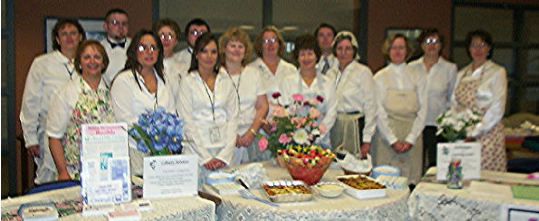
Library personnel at the 2005 Fall Library Open House

Over 55 faculty, staff and administrators attended the Library Open House, Books and Breakfast @ Your Library , held during Fall Conference week. Area Bed and Breakfast Inns, the President's office and the library staff combined to donate over sixteen door prizes to the event. Teapots, teacups and Victorian items from the open house will continue to be on display in the library until September 16.